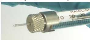
Male syringe with lipid